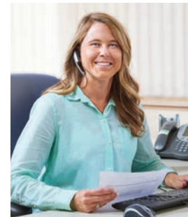
J. J. Keller® Client Service Specialist

With the J. J. Keller® Driver DataSense™ Service , you can reduce Hours of Service violations that result in fines and higher insurance rates ... maximize your investment in onboard technology ... cut administrative costs ... and have more time to manage drivers — not data.